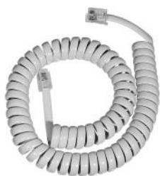
Handset Coil Cord