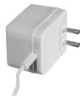
AC Power Adaptor